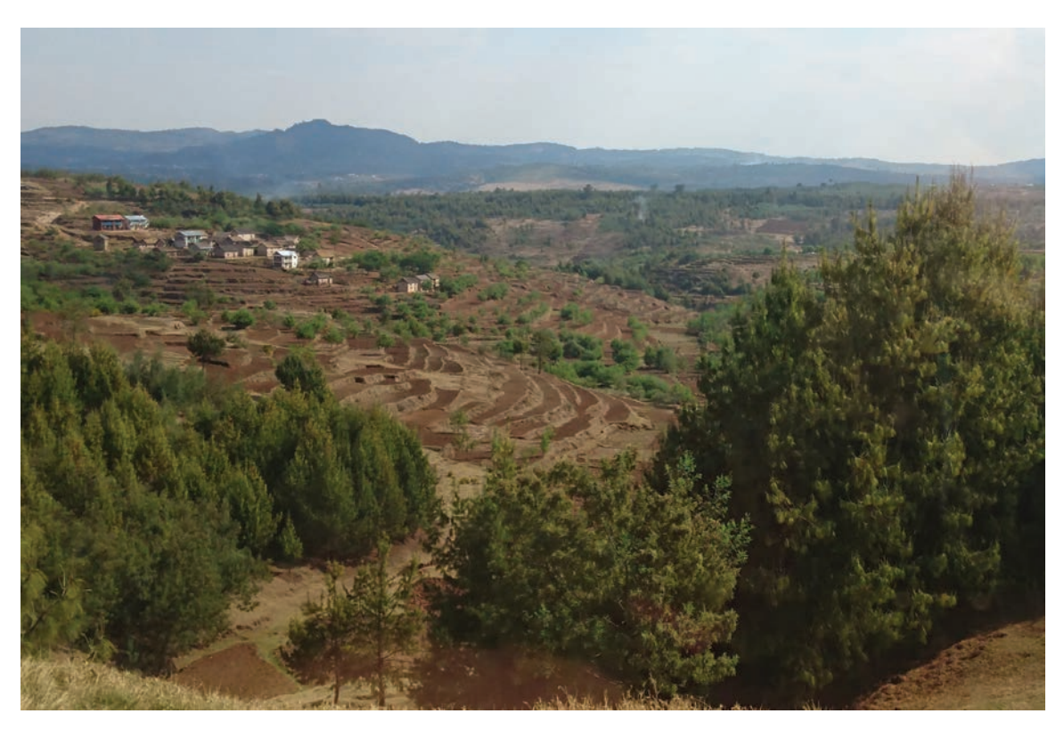
Fig. 5.1 for Question 5